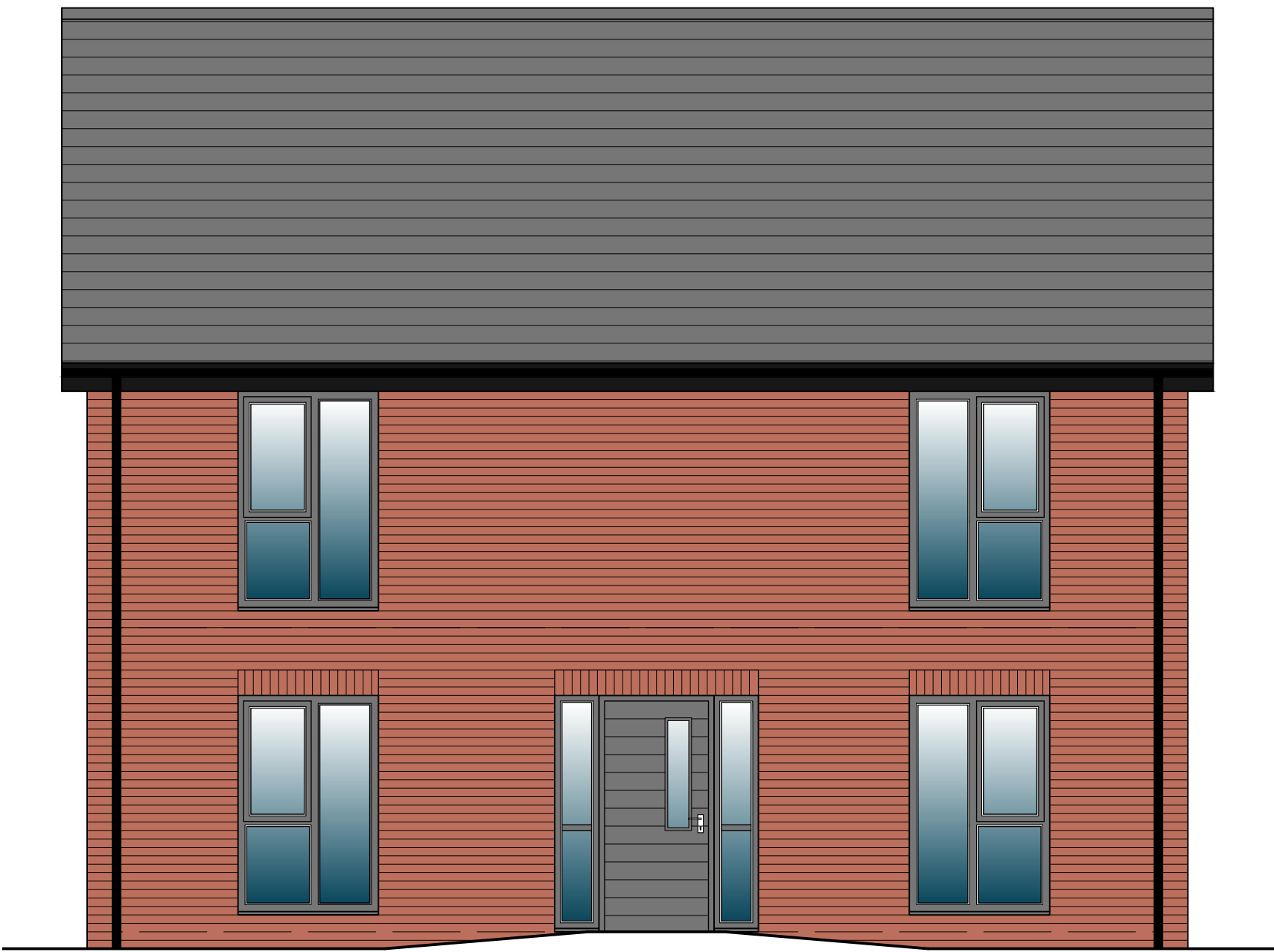
Type C Gable Elevation